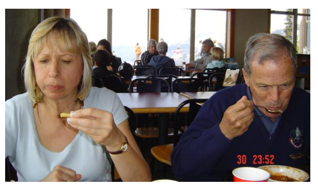
Then we arrived at Whistler – a tourist attraction and the venue of the 2010 Winter Olympics. A gondola to the top of the mountain for lunch,